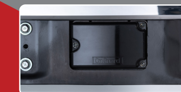
WABCO OnGuardACTIVE™ Collision Mitigation with Adaptive Cruise Control and Electronic Stability Control