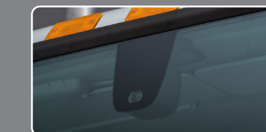
WABCO OnLaneALERT™ Lane Departure Warning System

* Available on select GVWR ++All features and options are subject to change without notice. ++For more model specifications, contact your local Hino dealer.