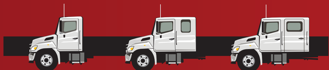
DAY CAB (Seats 3) BBC: 108" EXTENDED CAB (Seats 5) BBC: 138" CREW CAB (Seats 6) BBC: 152.8"